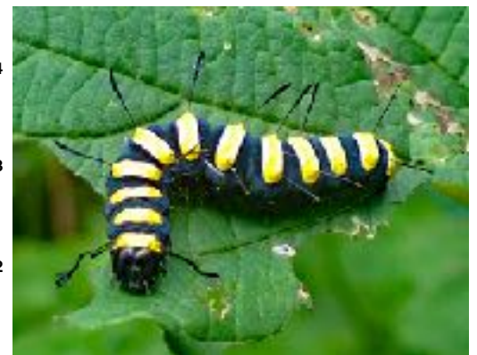
Keep an eye out for the Alder Moth caterpillar. Its striking black and yellow body with black spines make it very visible.