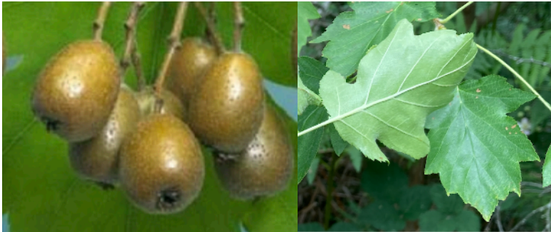
Sorbus torminalis fruit and leaves

Sorbus torminalis can usually be identified in Summer/Autumn by its berries. Its leaves could be mistaken for Wayfaring tree and Sycamore. Sorbus torminalis has one main vein with around 5 sets of side veins. but Sycamore has 5 large veins running from the stalk and Guelder Rose has three lobes.