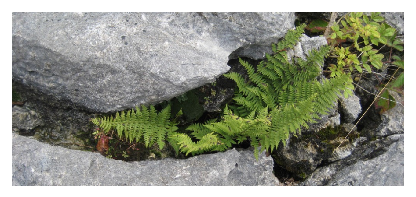
Dryopteris submontana historical data

The main diiagnostic features are the yellowish hairs on the leaves and the pointed teeth on the pinnules. The stalks are yellowish with a blackish base. They are visible from May to November and the spores ripen between July and September.