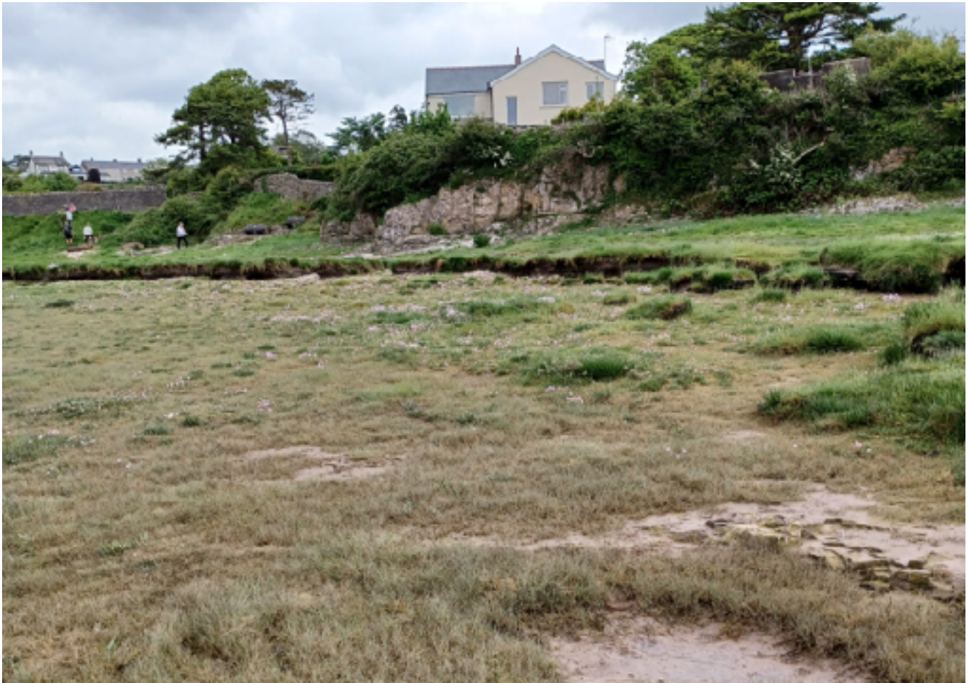
Grasses colonising August 2024