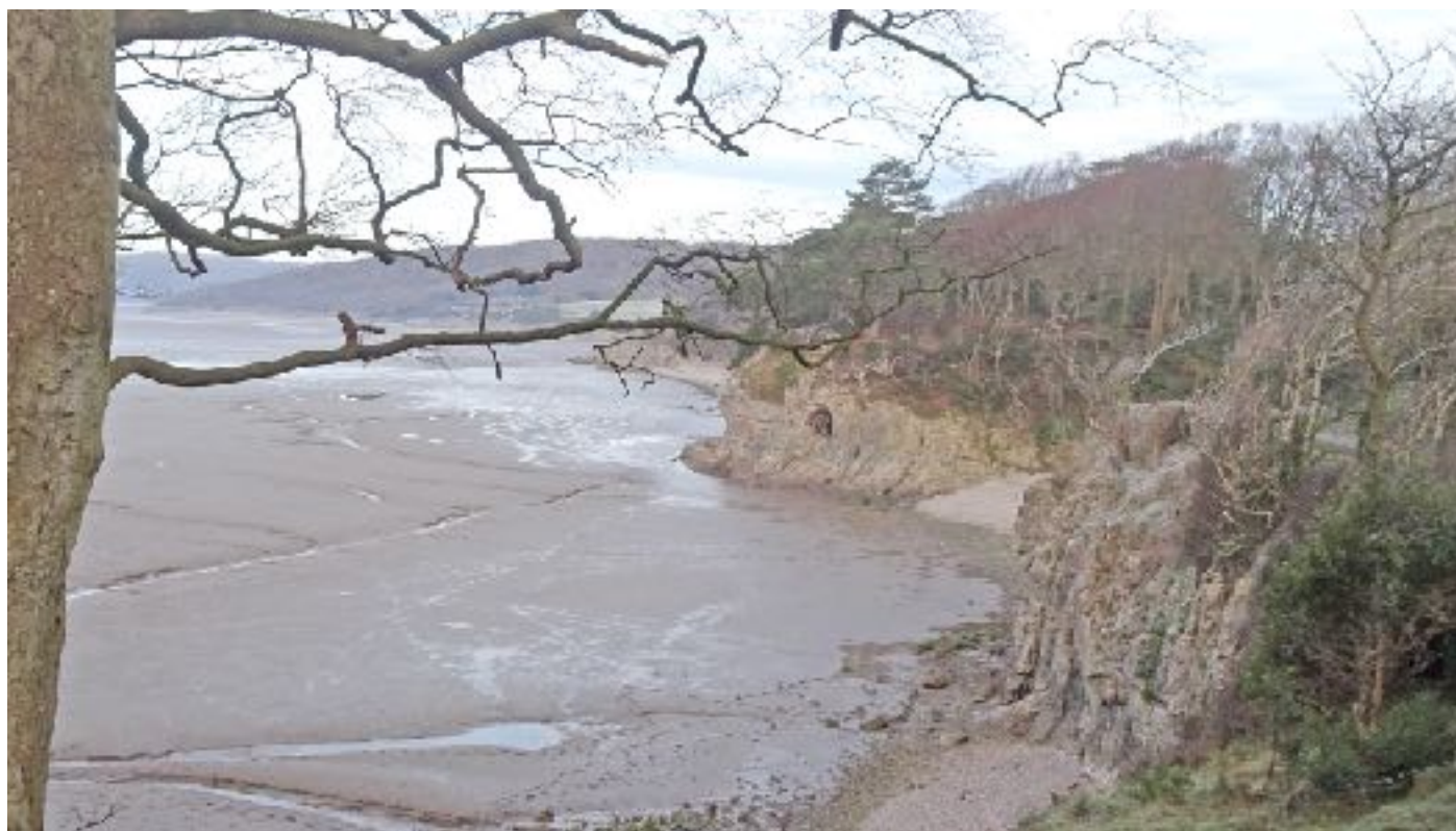
The Cove January 2020. The mud is now high enough to only be covered at spring tides.