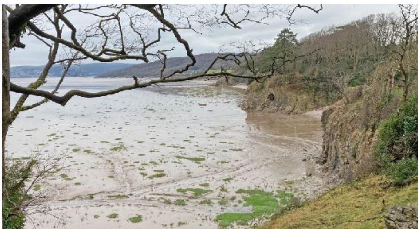
The Cove February 2024. Note the spartina has started to colonise the mud.