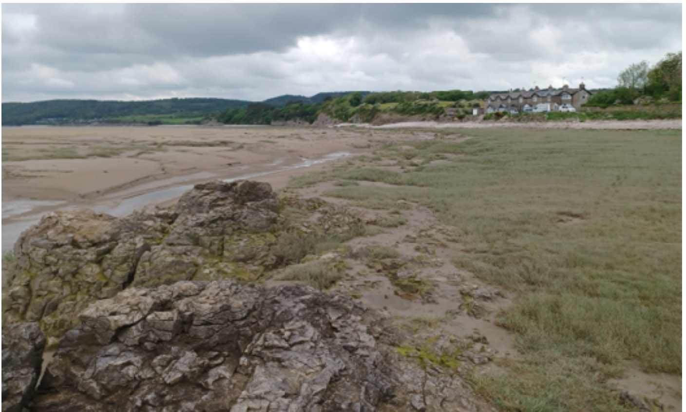
The Cove to Silverdale shore